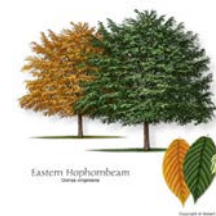
Ironwood Aka Hophornbeam (Spring Only)*