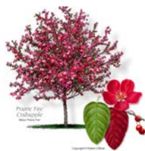
Crabapple (Spring or Fall)*