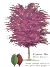
Frontier Elm (Spring Only)*