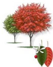
Autumn Brilliance Serviceberry (Spring or Fall)*