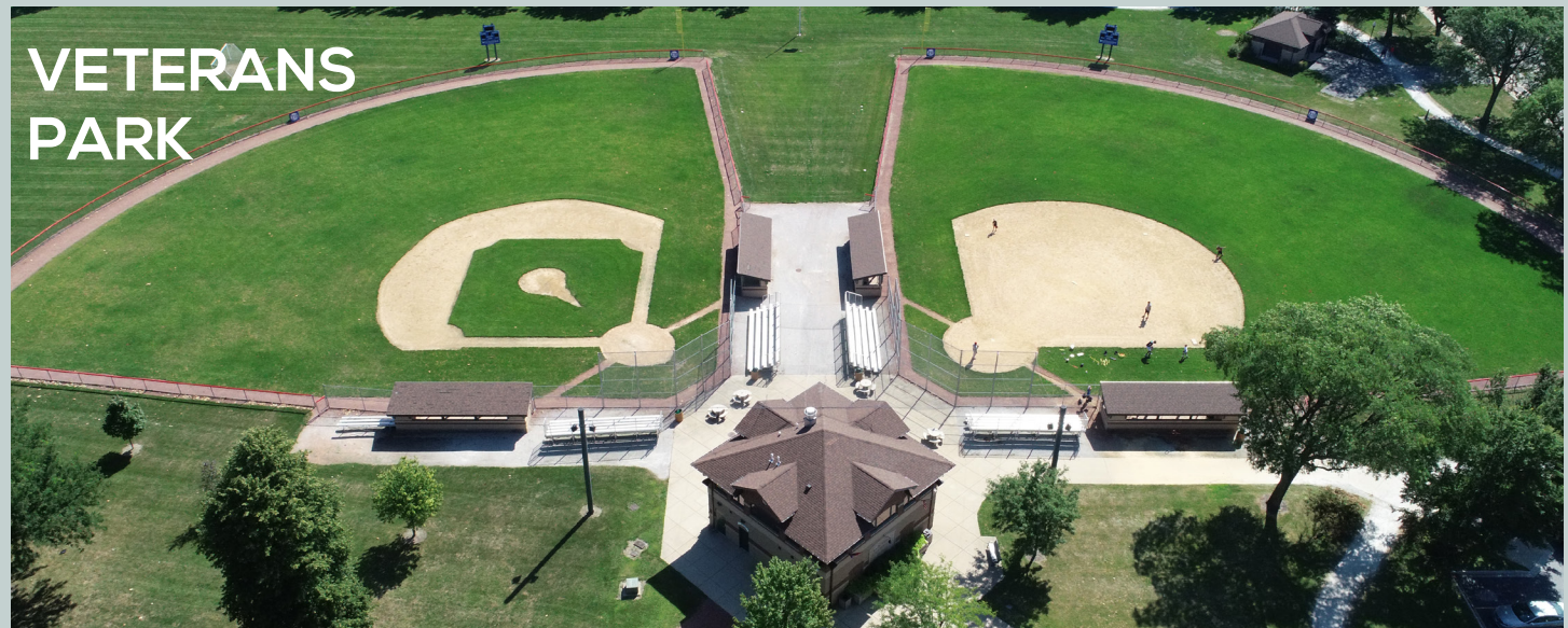
*Minimum 2-day tournament / $75 non-refundable per field deposit for tournament Optional: $45 per game per field charge for maintenance between tournament games