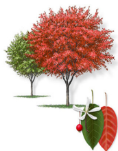
Autumn Brilliance Serviceberry (Spring or Fall)*