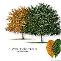
Ironwood Aka Hophornbeam (Spring Only)*