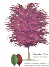
Frontier Elm (Spring Only)*