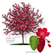
Crabapple (Spring or Fall)*