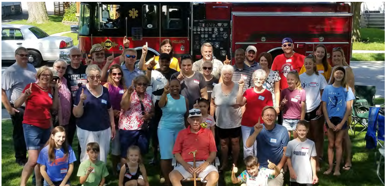
A group of neighbors gathered for their annual block party in the summer of 2019.

It may be overwhelming, however, to know where to start. If you don't yet know your neighbors, how do you suddenly get to know them? Sometimes it starts with the simplest of things, like a block party.