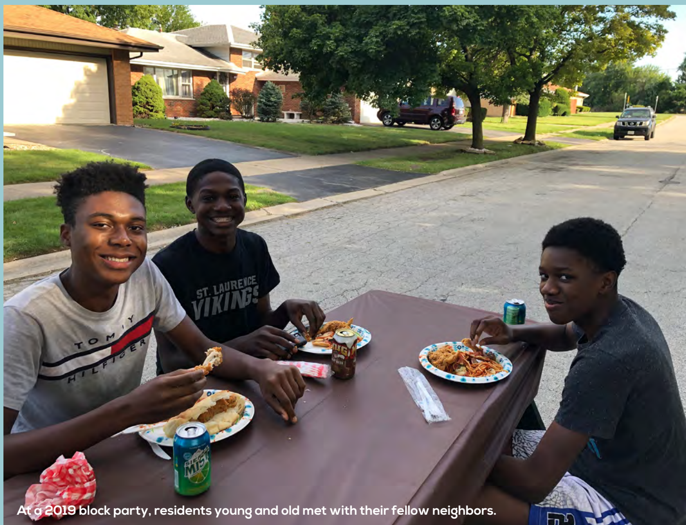
At a 2019 block party, residents young and old met with their fellow neighbors.