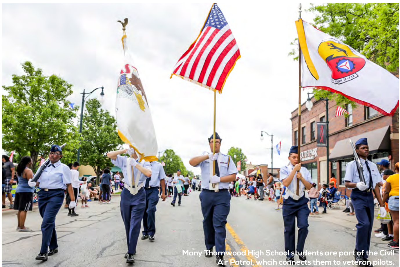
Many Thornwood High School students are part of the Civil Air Patrol, which connects them to veteran pilots.