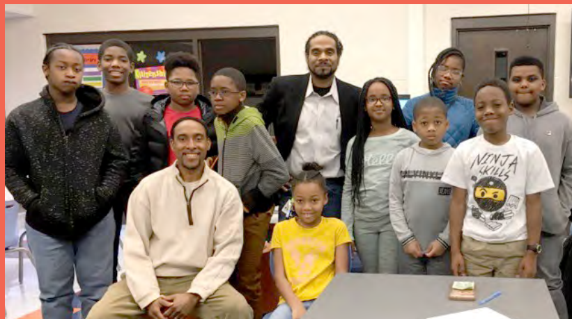
Students in the Next Generation Entrepreneurship program at McKinley School learn how to develop business plans.