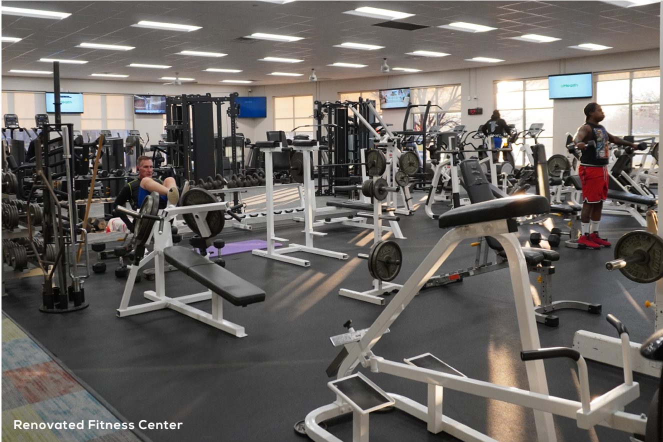
Renovated Fitness Center