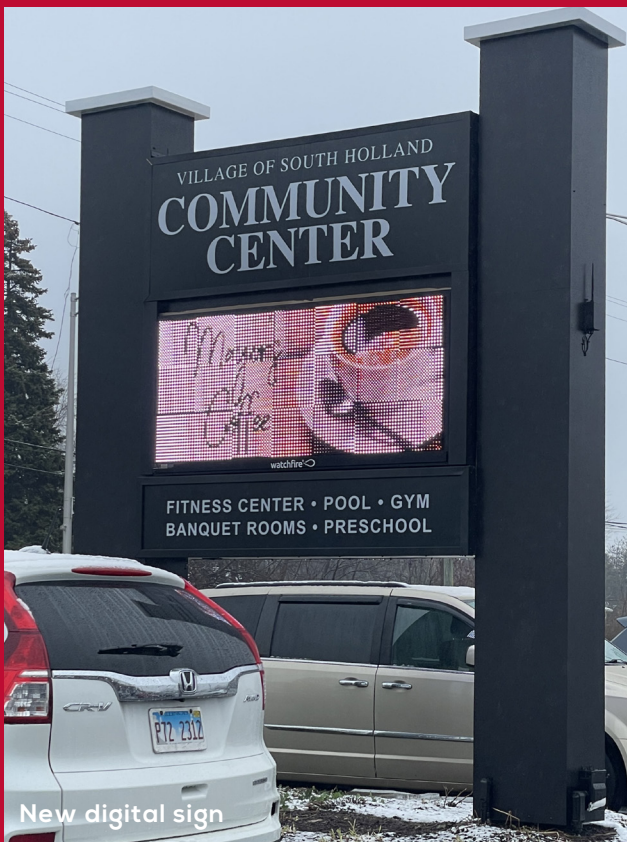
New digital sign