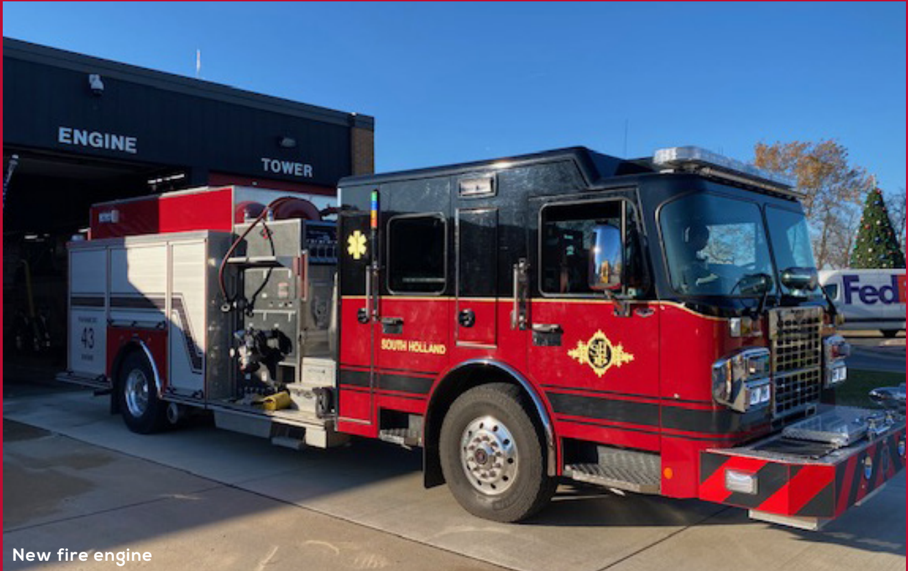
New fire engine