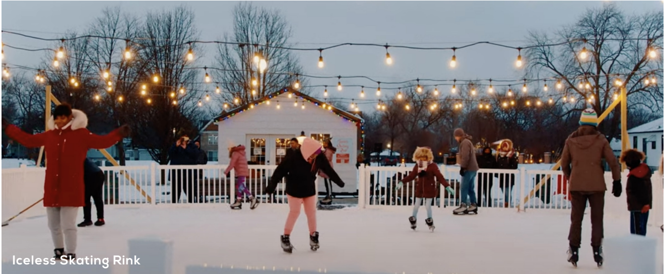
Iceless Skating Rink