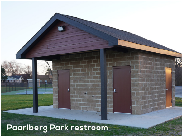
Paarlberg Park restroom

As part of our commitment to continual improvement of our parks and public services, the Village has built a new restroom facility at Paarlberg Park. The facility is an accessible restroom and will serve the patrons of the playground, pavilion, soccer fields, and pickleball courts starting on April 1, 2024.