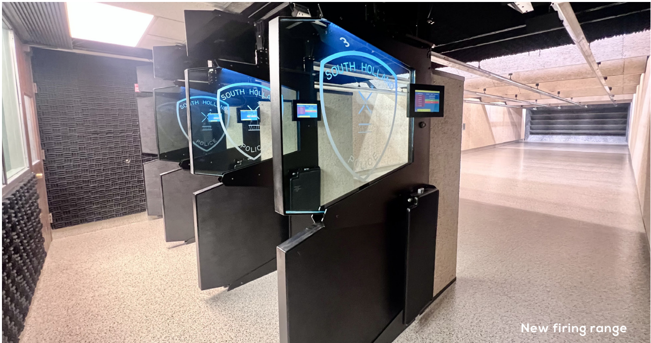
New firing range