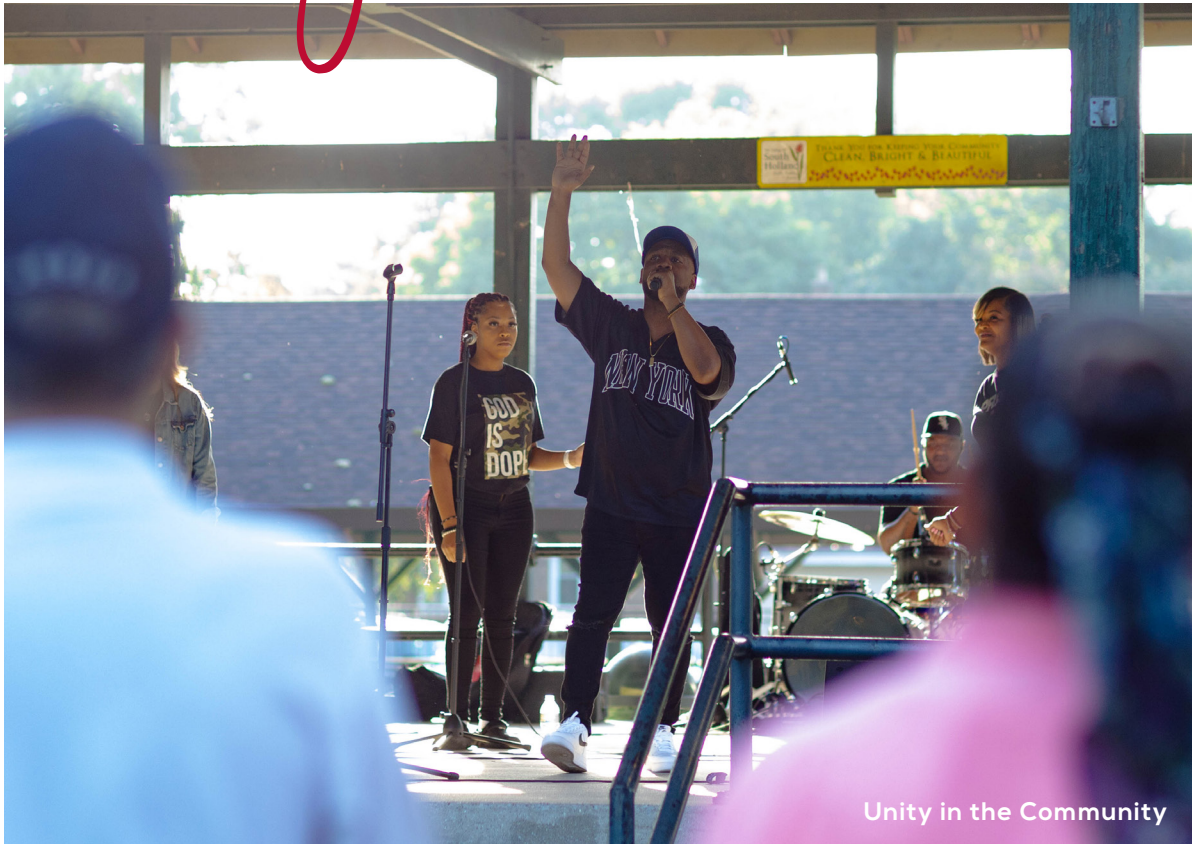
Unity in the Community

What a year it's been! As you can see, the Village of South Holland had an outstanding 2023. It was made even more special by the launch of our new strategic plan, Coming Together 2030 .