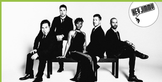
Featuring Hey Jimmy

Enjoy a Ravinia-style concert in our beautiful premier park!