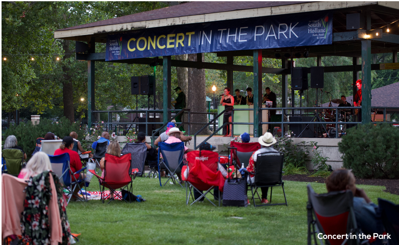
Concert in the Park