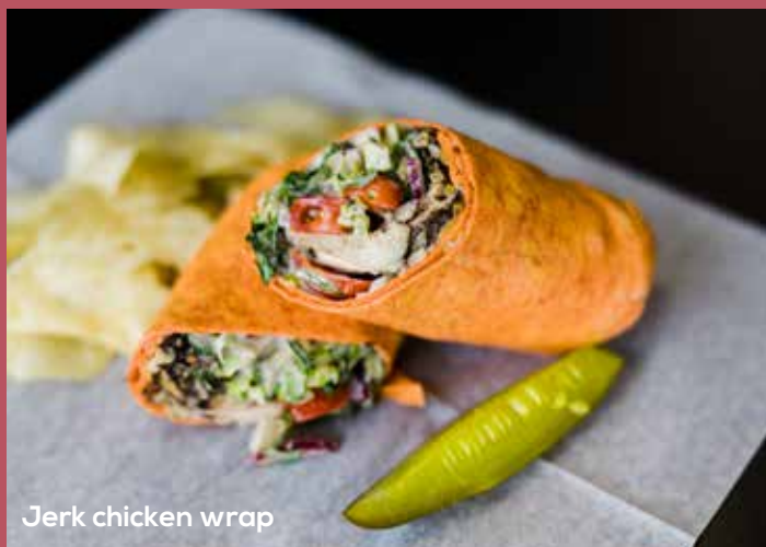
Jerk chicken wrap