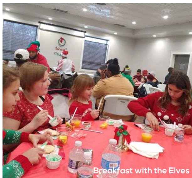
Breakfast with the Elves

February 10. In a clever twist, this “prom” was not for high school seniors, but for 55+ seniors, who were treated to dancing and food.