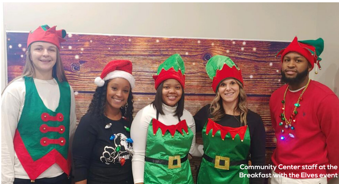
Community Center staff at the Breakfast with the Elves event

The pair of Recreation Program Assistants are both in their late 20s, and were hired in 2022, injecting new life into the programming of the South Holland Community Center after a couple of pared-down pandemic years.