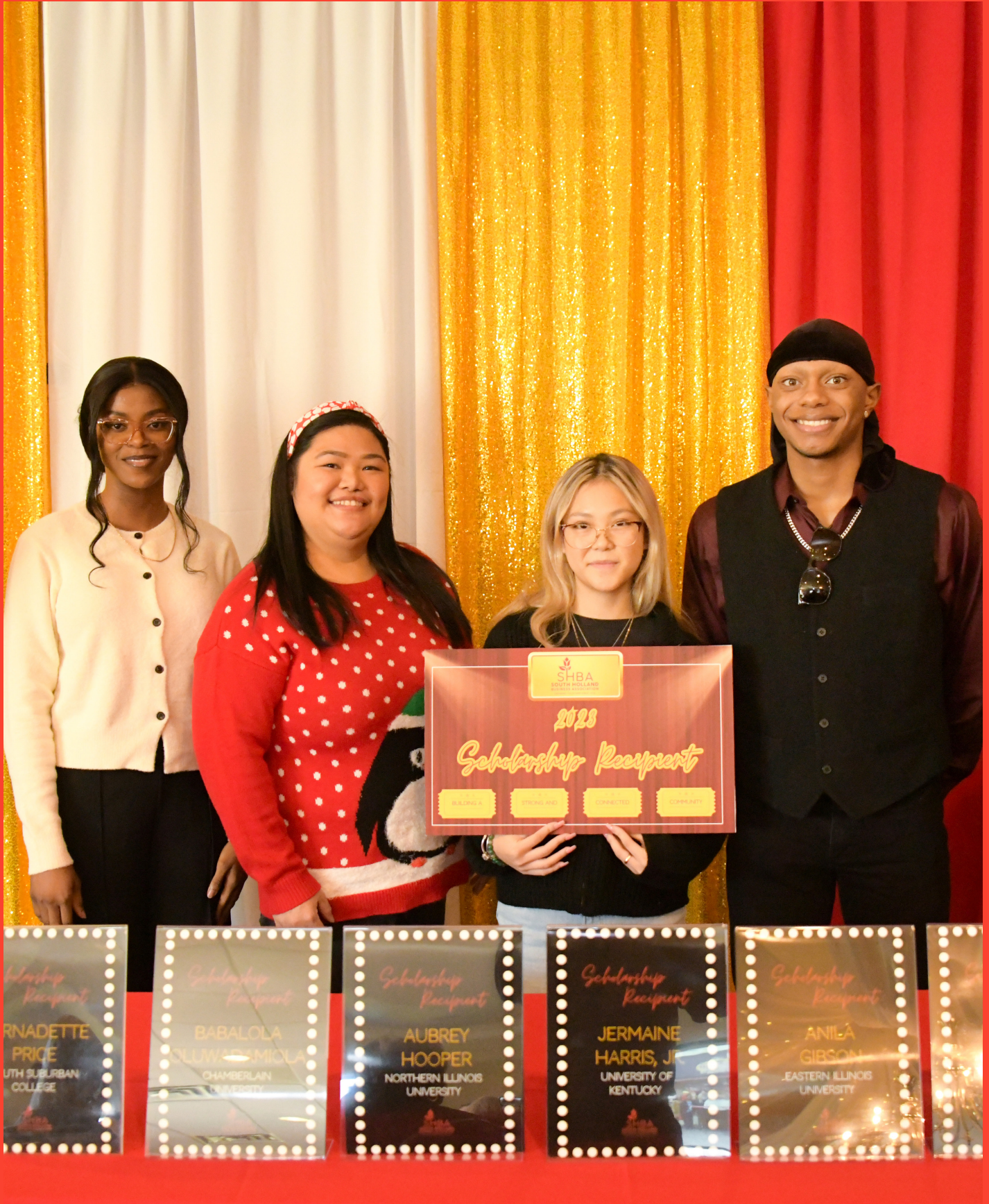
SHBA granted $8,750 in scholarships to local college students in 2023