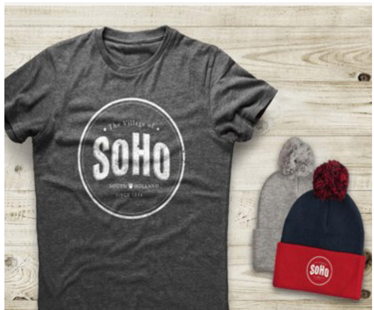
Community Pride Apparel

As a way to foster and promote the arts, we partnered with what was once the South Suburban Chorale to form the South Holland Master Chorale. The Chorale has often been recognized as one of the premier singing ensembles in the region. They perform from October through May in various concerts throughout South Holland and neighboring communities.