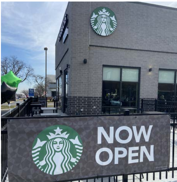
Starbucks Grand Opening