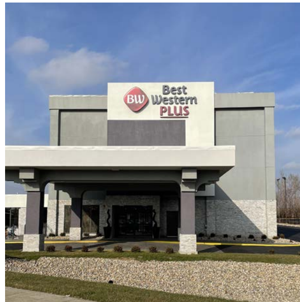
Hotel Corridor Redevelopment