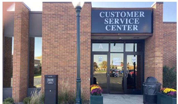
Customer Service Center

The Village is building a brand-new facility for the Public Works department, at 155 W 162nd St. The existing Public Works facility, which was built when our population was much lower, can no longer accommodate the modern fleet and services. The new facility will have more space for work and storage, and also includes a salt dome for environmentally responsible road salt storage. The current facility will be turned into a full-service vehicle maintenance facility for all Village equipment.