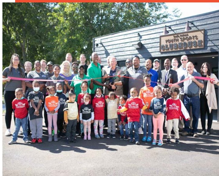
Youth Sports Clubhouse

View the complete list of the 200 projects completed through Vision 2022 at southholland.org !