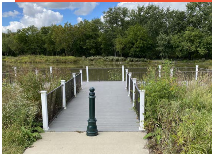
Veterans Park Observation Deck

Over the past few years, the South Holland Community Center underwent a major face-lift. Renovations included a brand-new front desk that was moved to the central part of the lobby, a glass-walled conference room, completely renovated locker rooms, new signage, and aesthetic improvements to the banquet rooms. 🔥