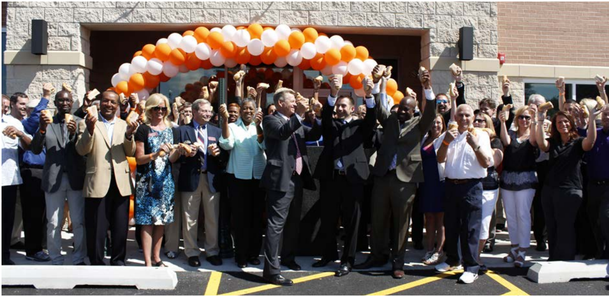
Panera Ribbon Cutting

The three-year enhancement of all of our Halsted Street hotels has upgraded that corridor with national brands that reflect their corporate brand standards and those of the Village. This greatly increases the opportunity to attract business and family travelers alike, bringing additional revenue potential to the village.