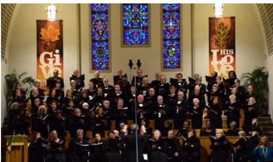
South Holland Master Chorale