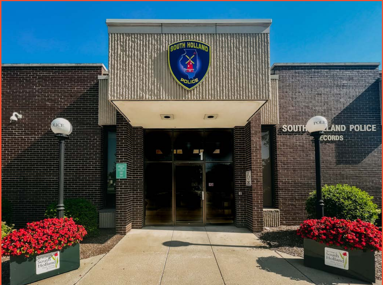
New Police Department Facility

In 2016, the SHPD moved into a larger, more centralized building on South Park Avenue. The new facility boasts over 33,000 square feet, with private meeting rooms, a bright, modern waiting area, and advanced video technology to ensure the safety of detainees, visitors and officers.