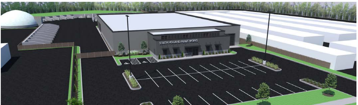
New Public Works Facility