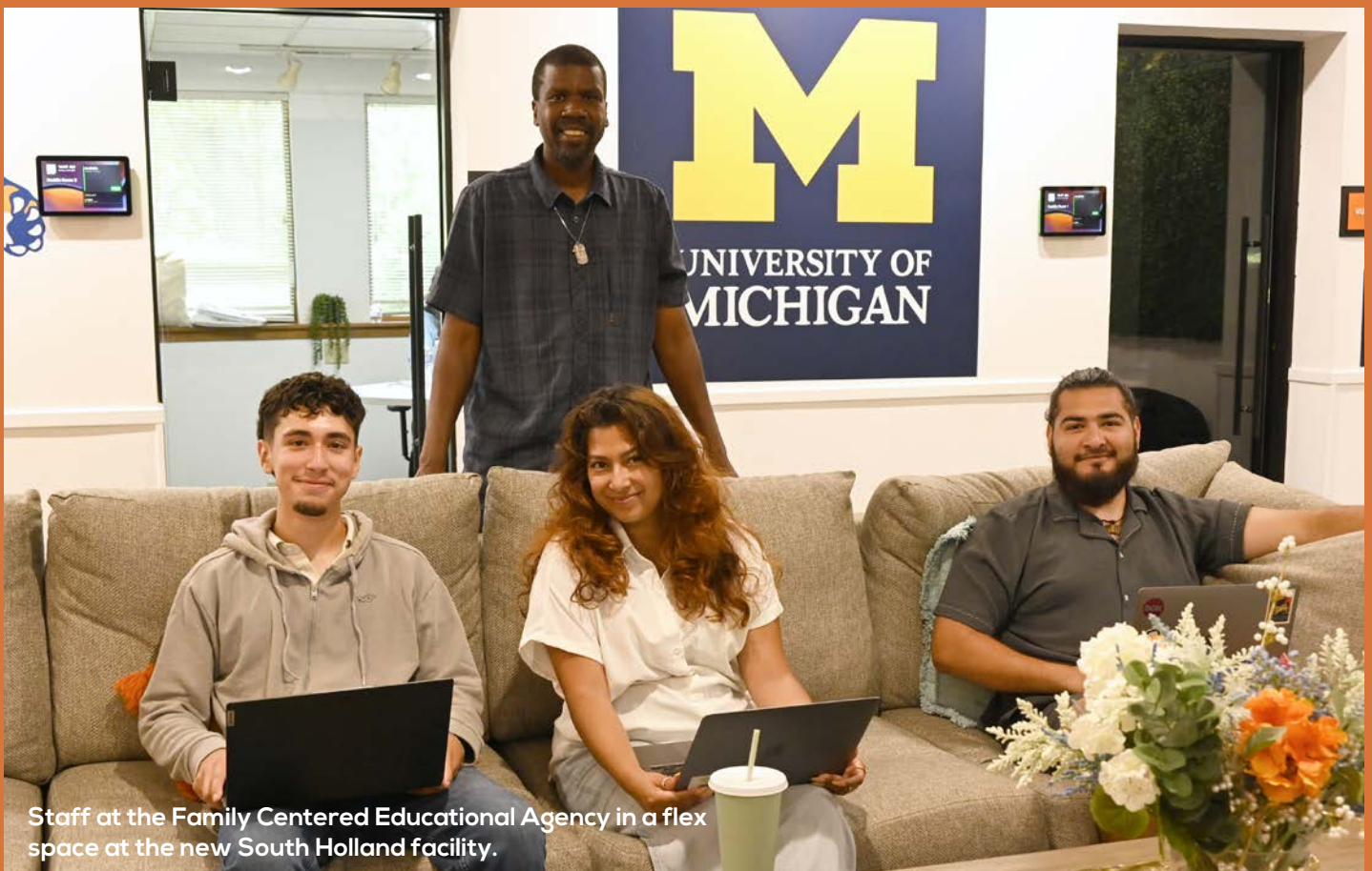
Staff at the Family Centered Educational Agency in a flex space at the new South Holland facility.